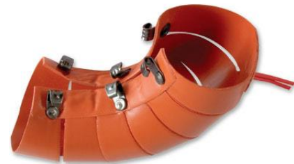
Electronic Component Production