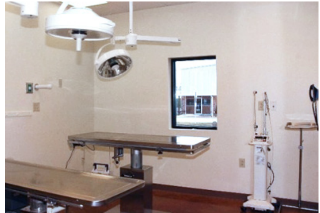
Heated surgical table helps prevent hypothermia during small animal surgeries.