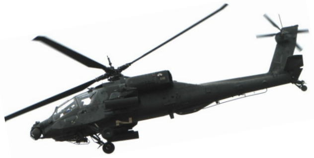
...or in the air