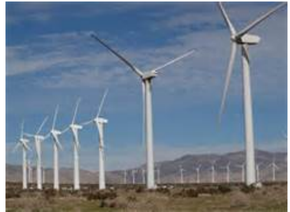
Applications: On the ground....